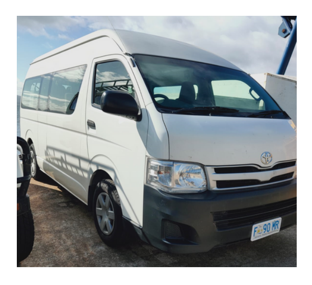
Toyota Coaster (top and middle) and Toyota Hiace Commuter (bottom)